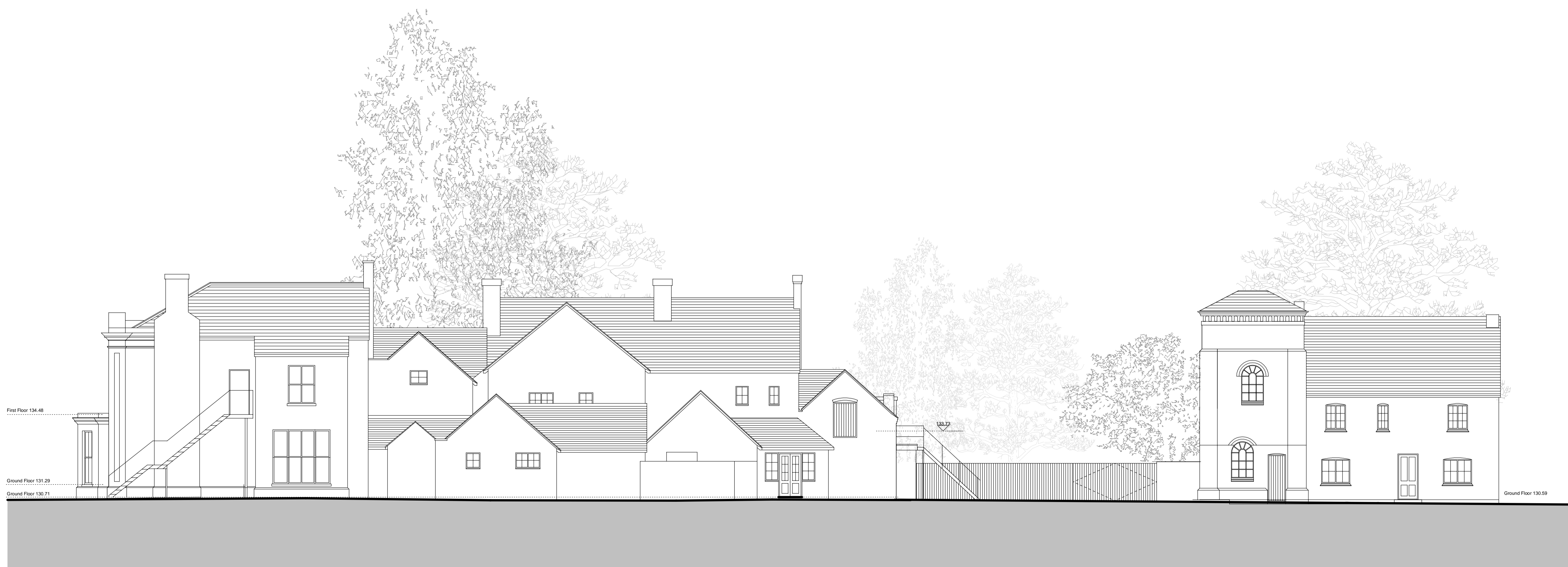
EXISTING NORTH EAST ELEVATION