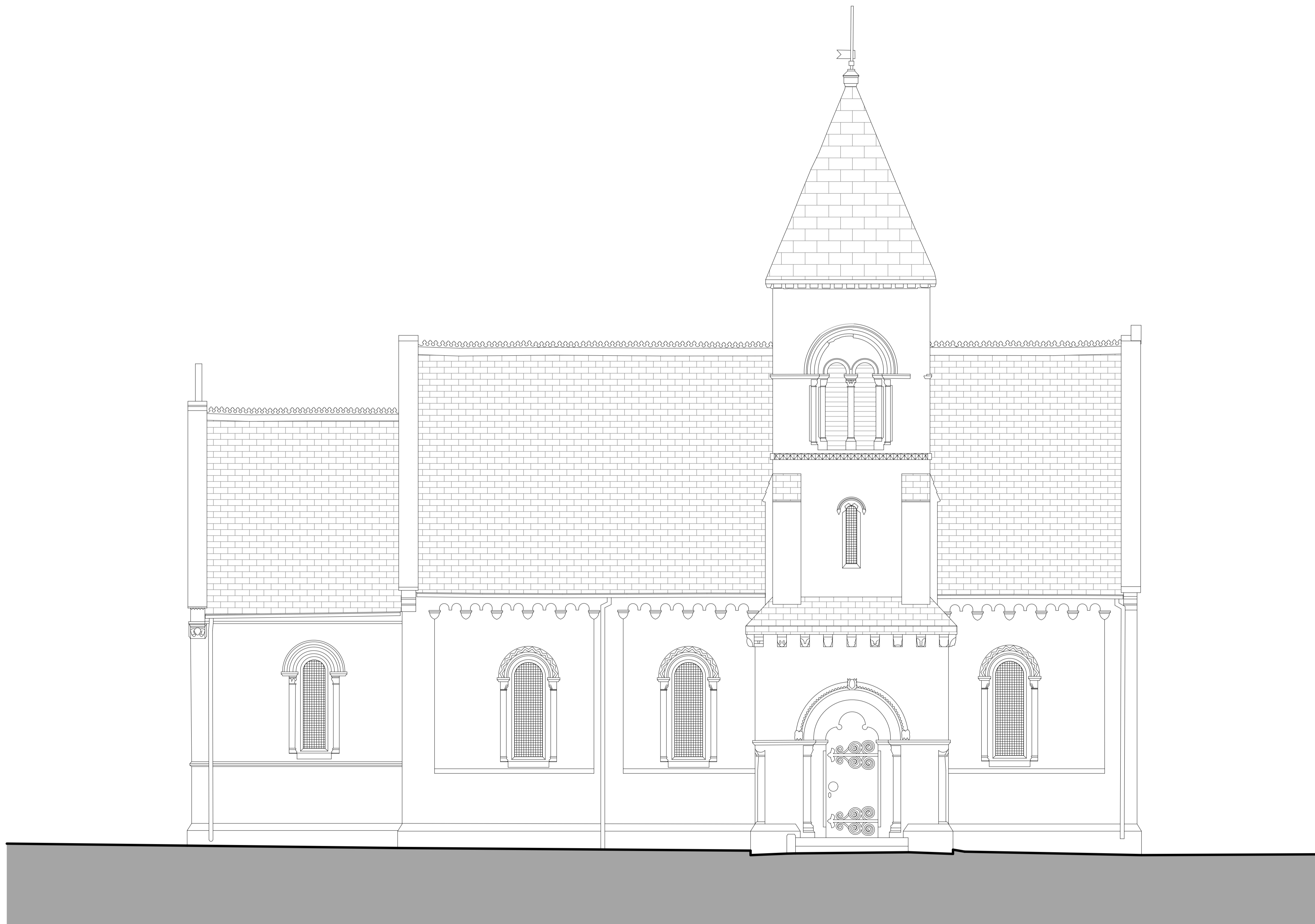
North Elevation - Existing