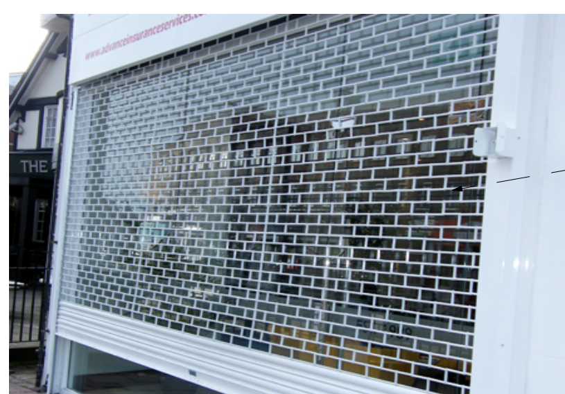
Example of proposed open lath white finished roller shutter