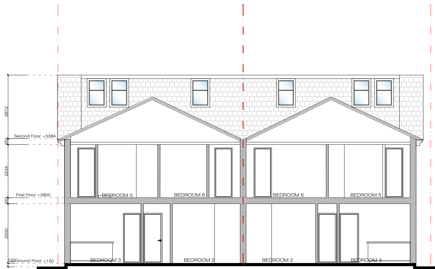
01 Cross Section scale: 1:50