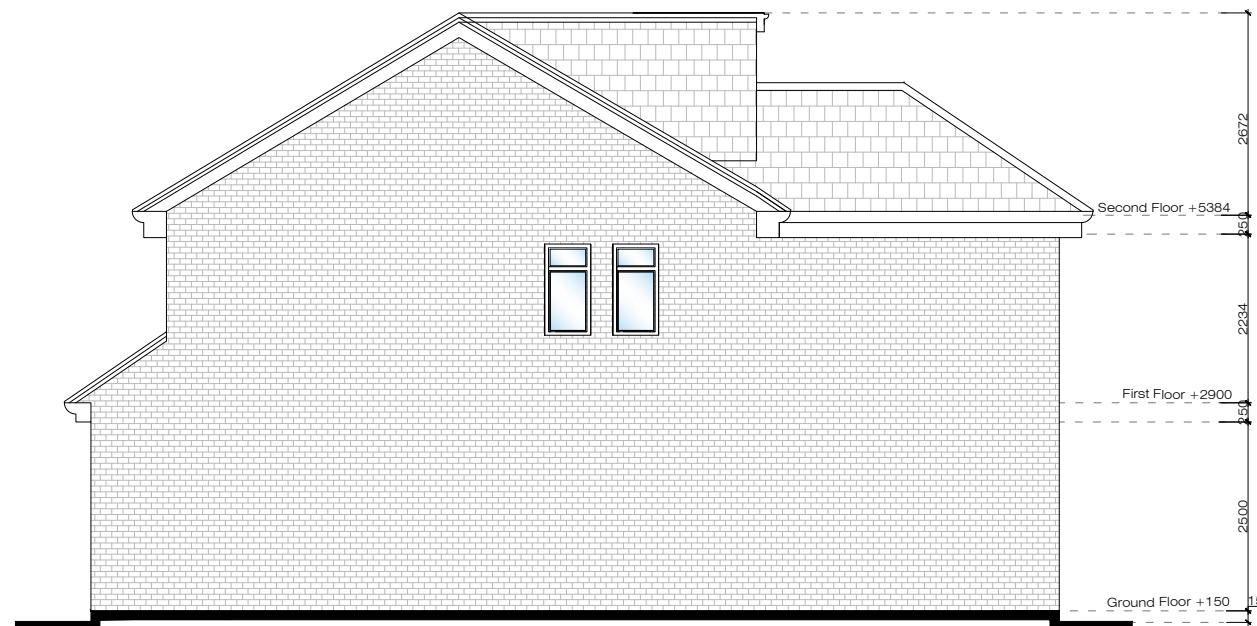
02 West Side Elevation scale: 1:50