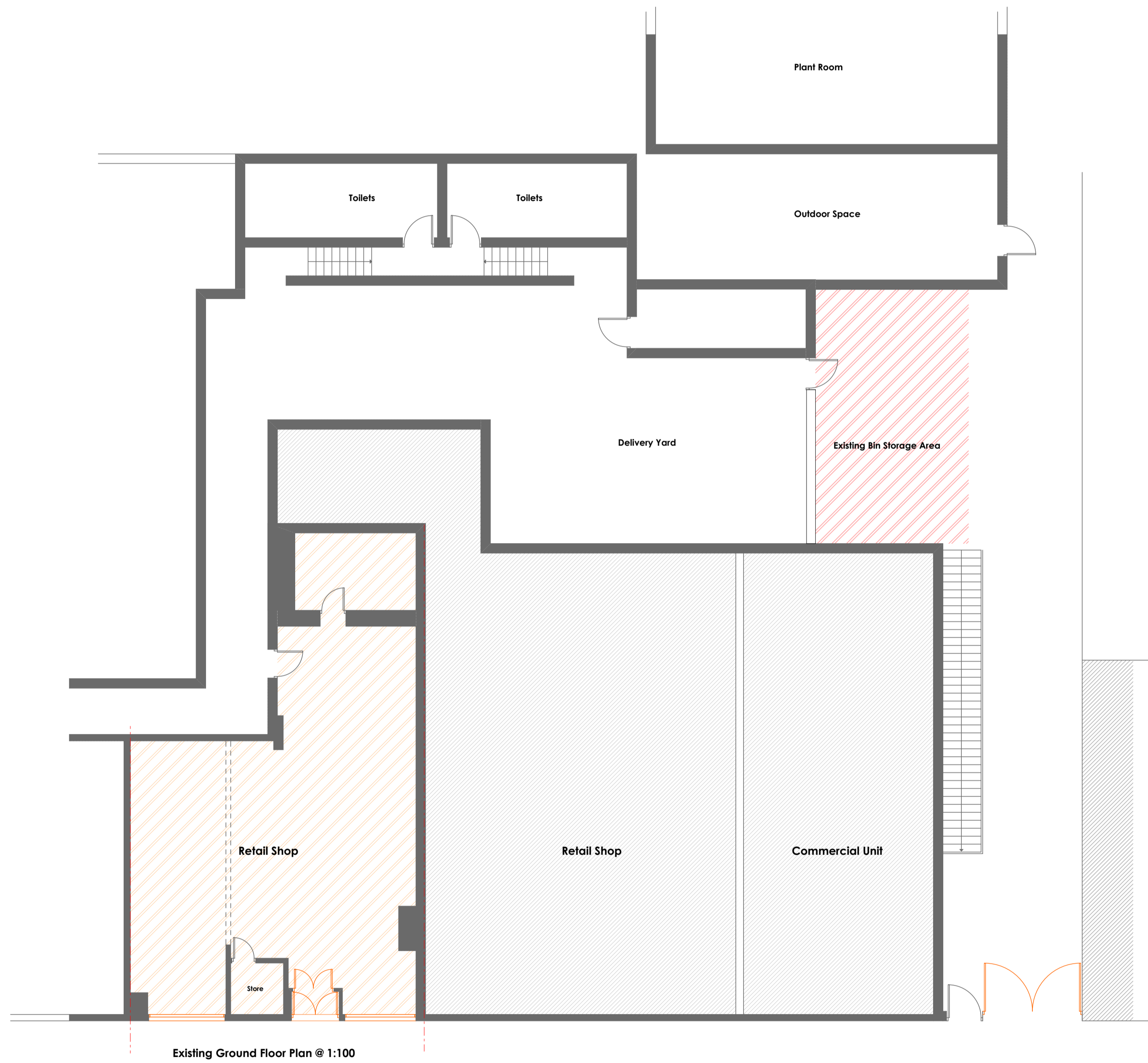
Existing Ground Floor Plan @ 1:100