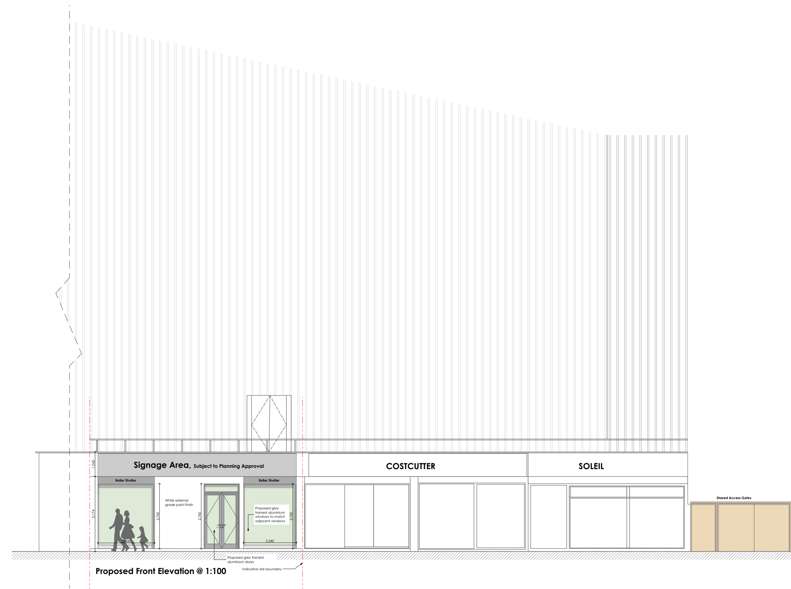
Proposed Front Elevation @ 1:100