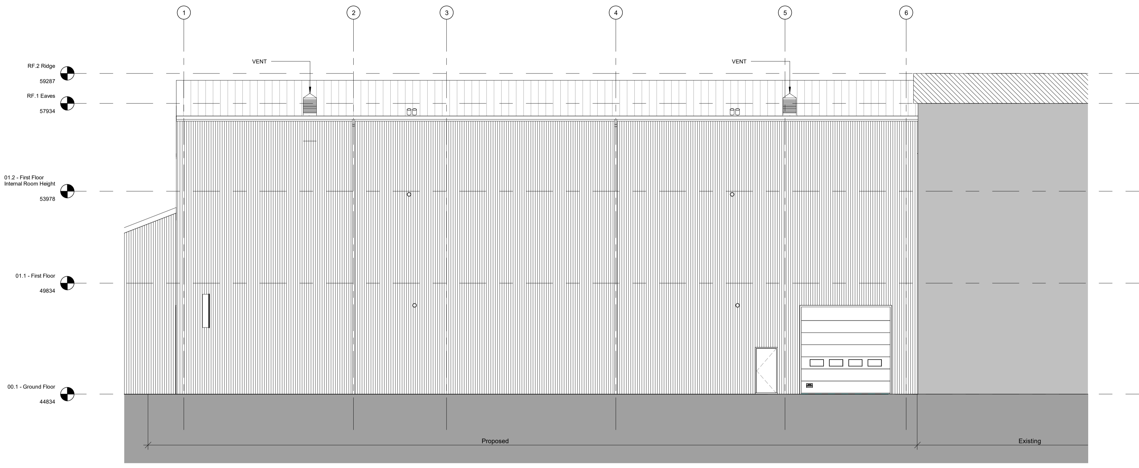
① East Elevation 1 : 100

Doors & Flashings Colour: Dark Blue to match existing