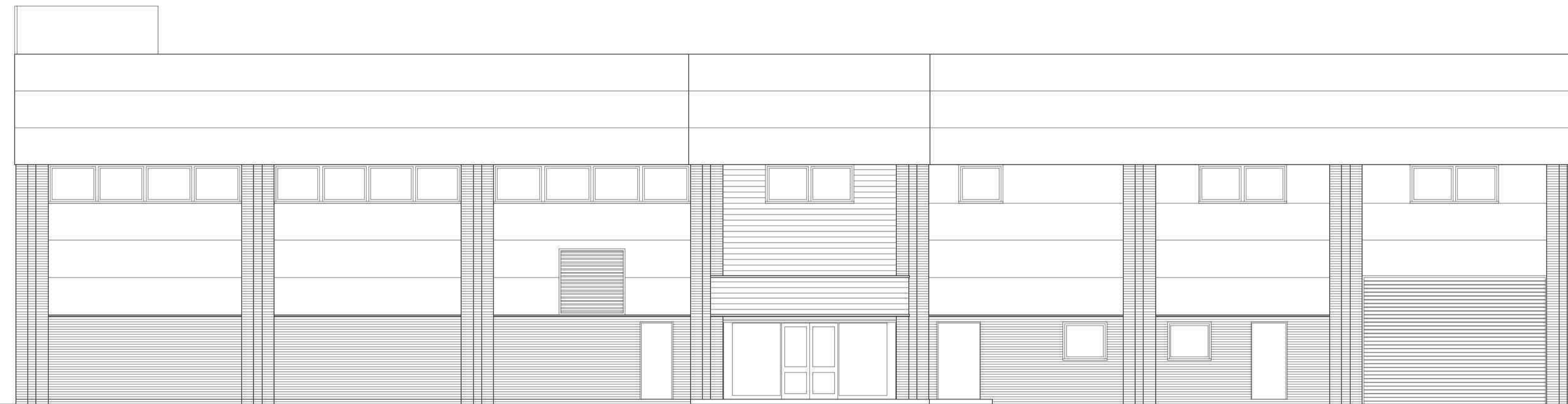
North East Elevation - Scale 1:100@A1

This drawing is to be read in conjunction with drawings:-