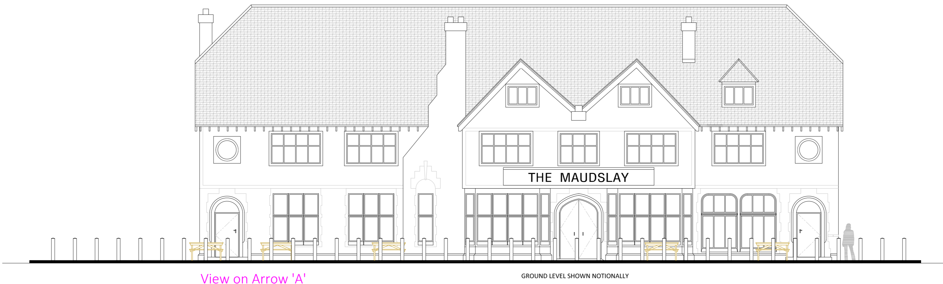
View on Arrow 'A'