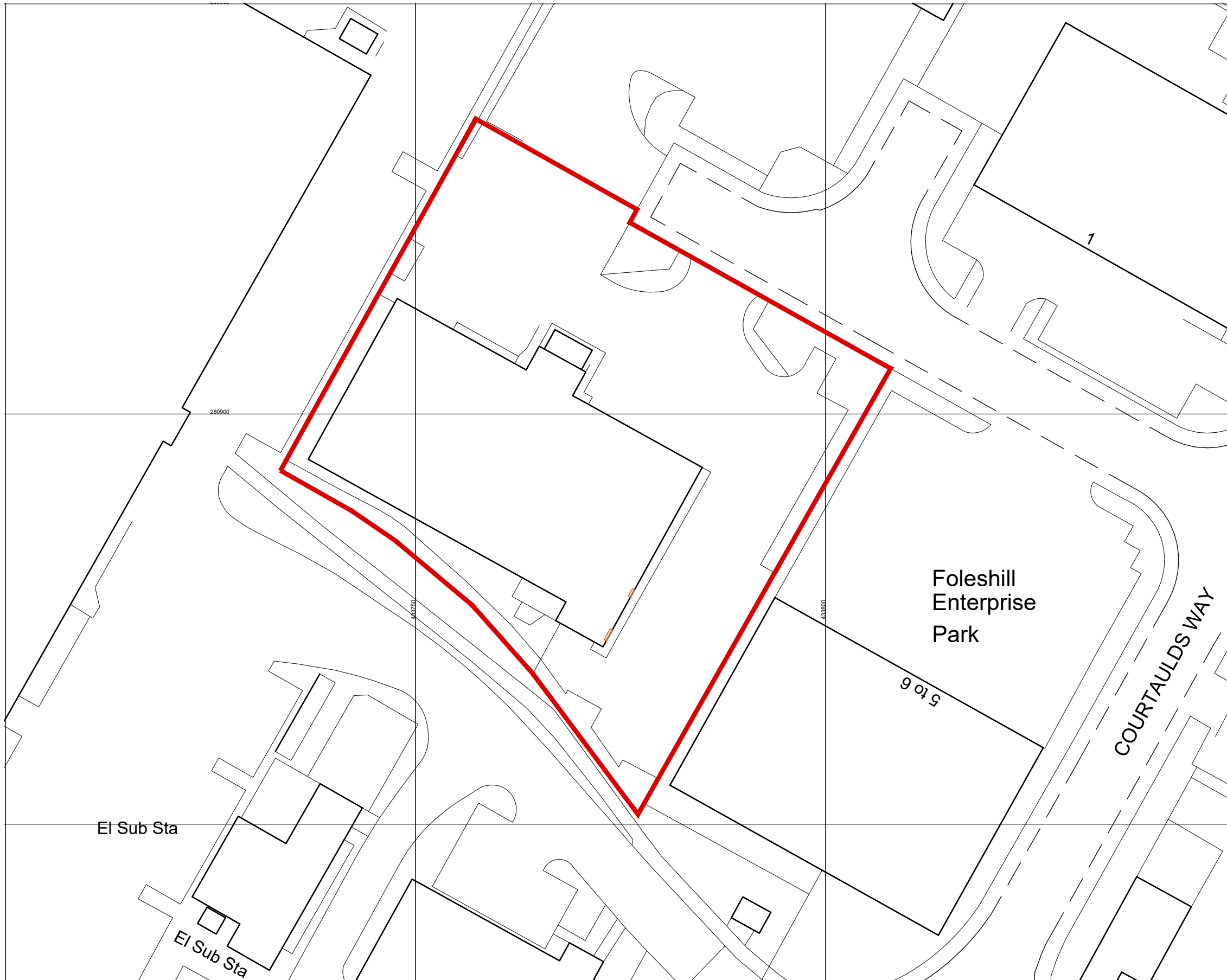
Block Plan - Scale 1:500@A3