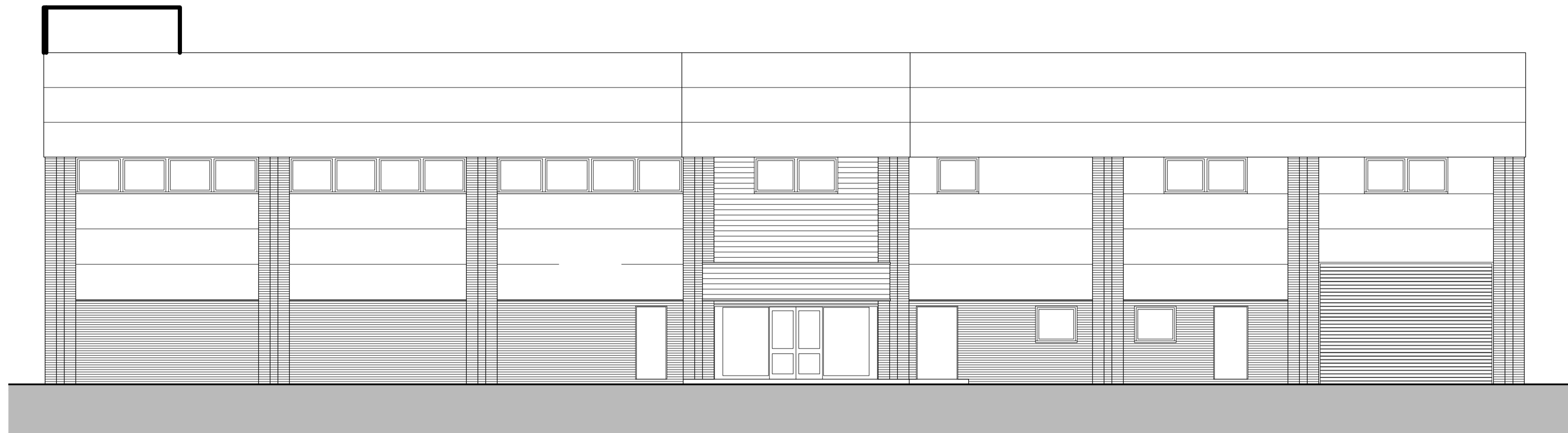
North East Elevation - Scale 1:100@A1

This drawing is to be read in conjunction with drawings:-