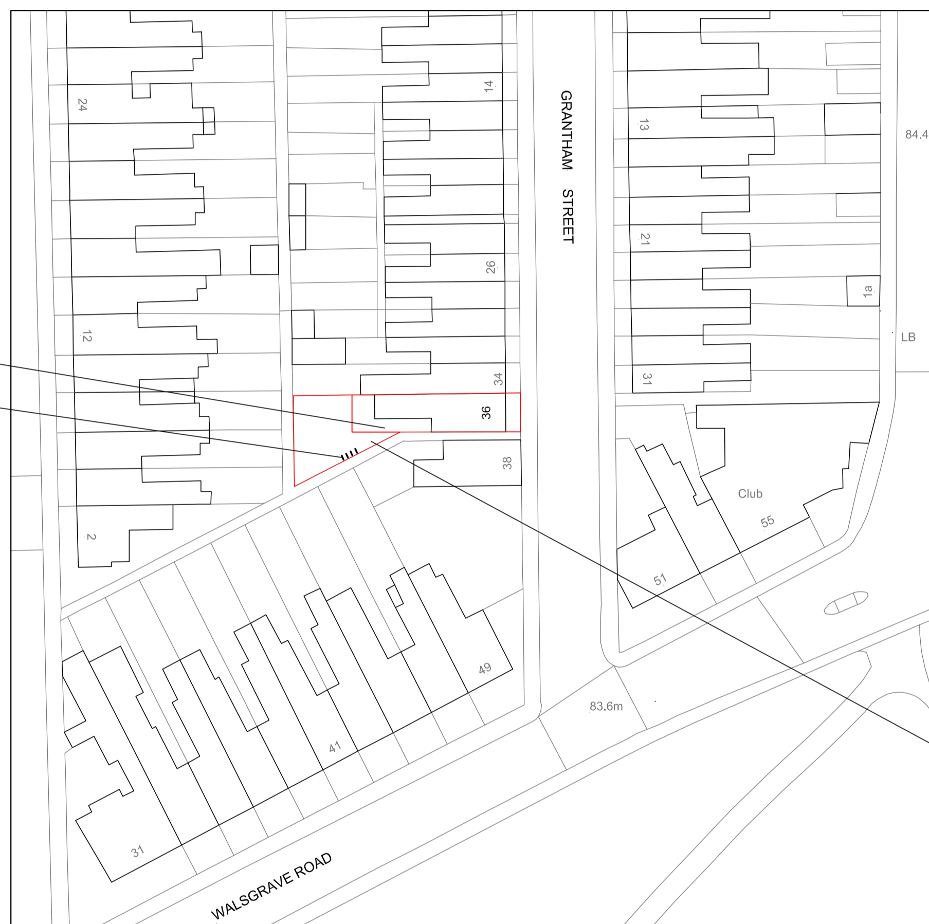
Proposed Site Plan Scale 1:500 @ A1

Change of Use to Flats 4 No 'Sheffield' cycle storage hoops to be positioned against boundary. 8 No bikes to be allowed for in total.