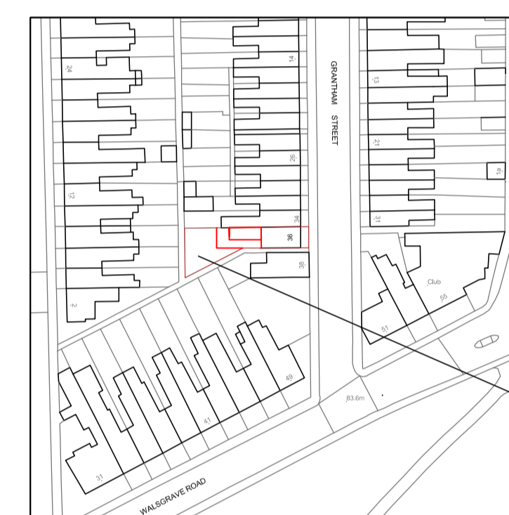
Location Plan Scale 1:1250 @ A1