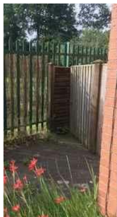
1 - Timber gate to be removed

IDP GROUP 27 SPON STREET COVENTRY CV1 3BA T: +44 (0)24 7652 7600 E: info@idpgroup.com www.weareidp.com