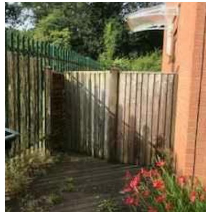
3 - Timber gate and fence to be removed