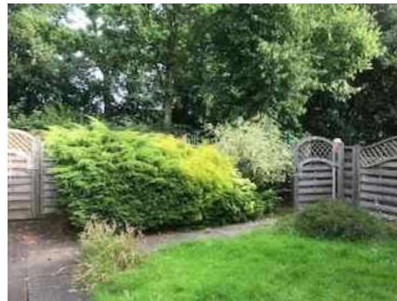
4 - Timber gate and fence to the front of the property to be replaced with Palisade fence to match existing