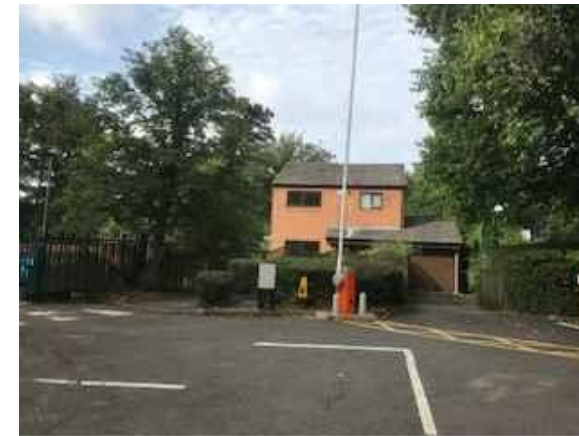
5 - Front elevation