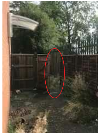
2 - Timber fence to be removed. Gate to be installed in Palisade fence