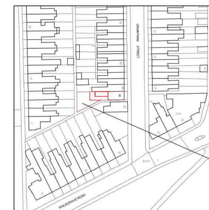
Location Plan Scale 1:1250 @ A1