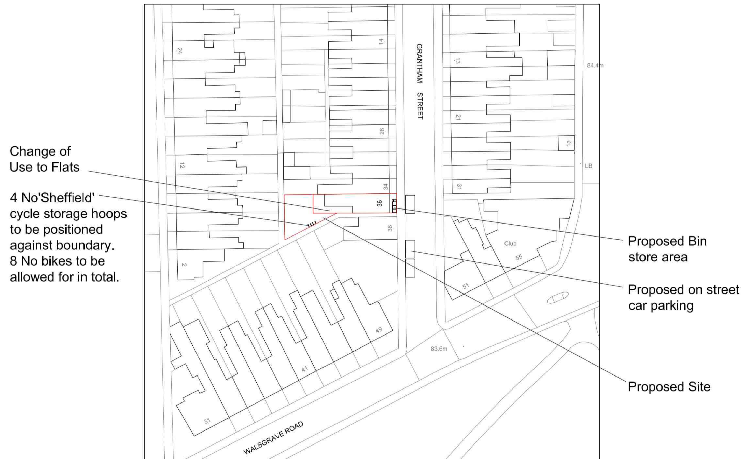
Block Plan Scale 1:500 @ A1

GENERAL NOTES DRAWING CAN BE SCALED FOR PLANNING SUBMISSION PURPOSES ONLY BUT IF IN ANY DOUBT ABOUT A DIMENSION OR ANY OF THE DRAWN INFORMATION PLEASE ASK CDRB ARCHITECTS LTD.