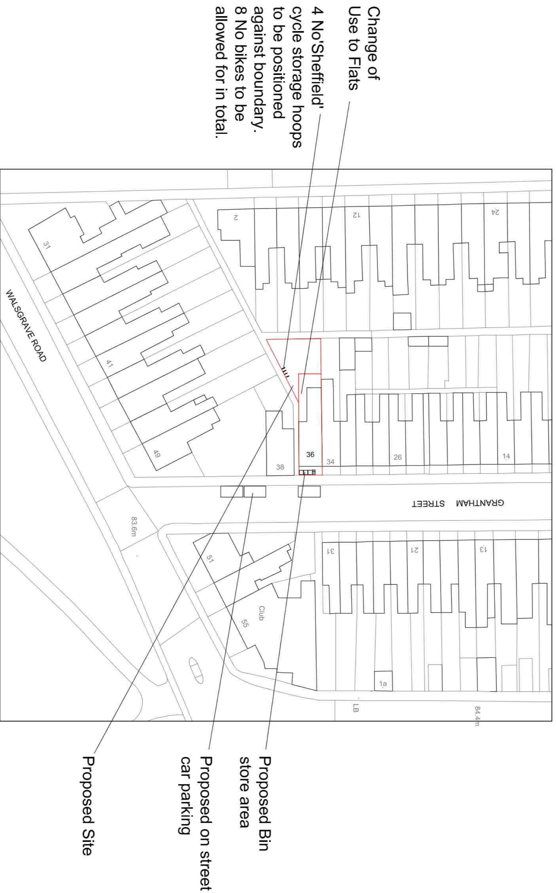
Block Plan Scale 1:500 @ A1

GENERAL NOTES DRAWING CAN BE SCALED FOR PLANNING SUBMISSION PURPOSES ONLY BUT IF IN ANY DOUBT ABOUT A DIMENSION OR ANY OF THE DRAWN INFORMATION PLEASE ASK CDRB ARCHITECTS LTD.