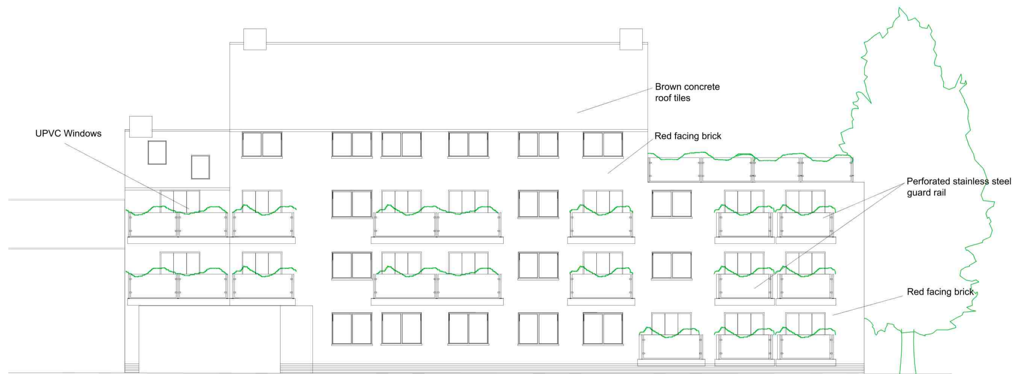
Proposed Rear Elevation Scale 1:100 @ A1