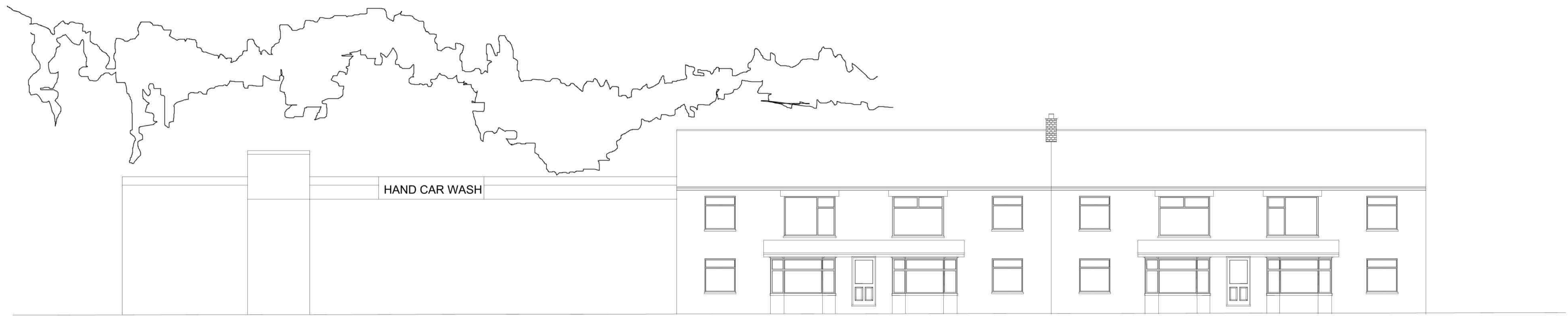
existing front - Humber Road - elevation Scale 1:100 @ A1

GENERAL NOTES DRAWING CAN BE SCALED FOR PLANNING PURPOSES ONLY BUT IF IN ANY DOUBT ABOUT A DIMENSION OR ANY OF THE DRAWN INFORMATION PLEASE ASK CDRB ARCHITECTS LTD.