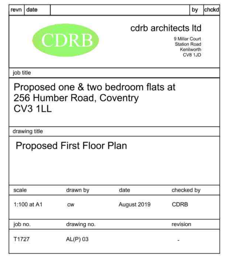
Proposed First Floor Plan Scale 1:100 @ A1

Z:\Job Files\10-PROJECT\11727-Humber Road Car wash Coventry PDWGS\Ready\03-T1727_AL_P 03 15.8.19 on Proposed First floor plan.dwg - First floor plan