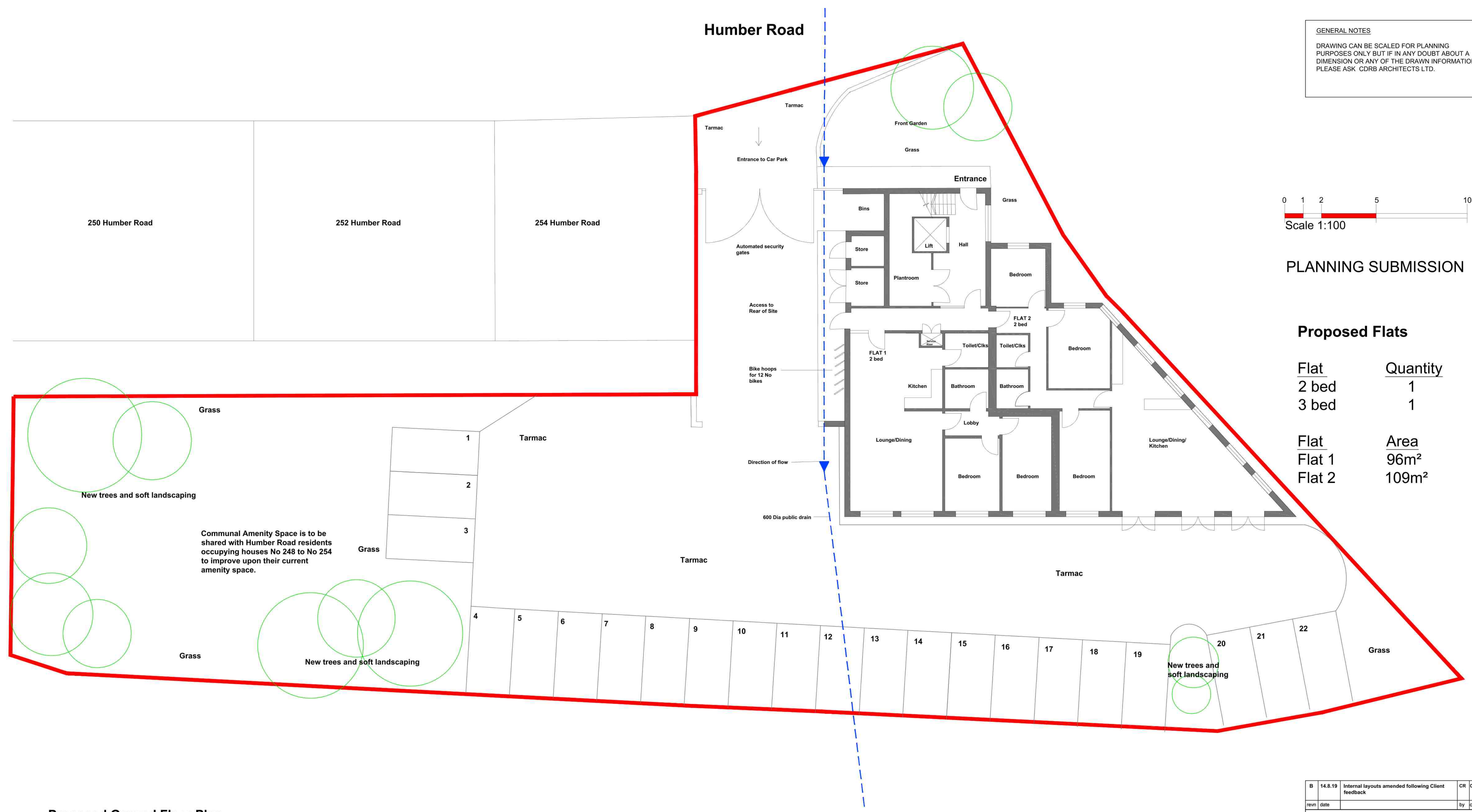
Proposed Ground Floor Plan Scale 1:100 @ A1