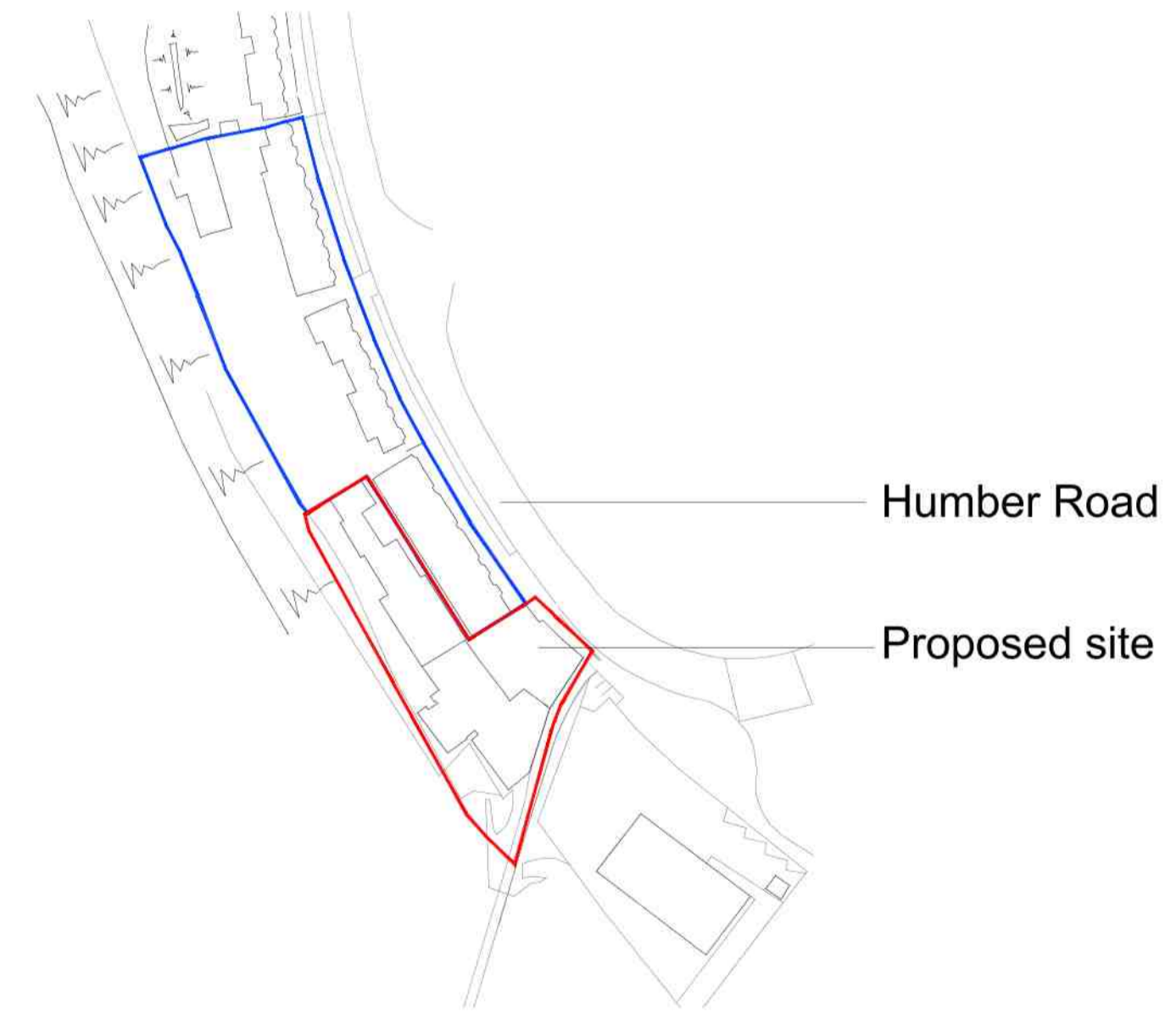
Existing Location Plan Scale 1:1250 @ A1