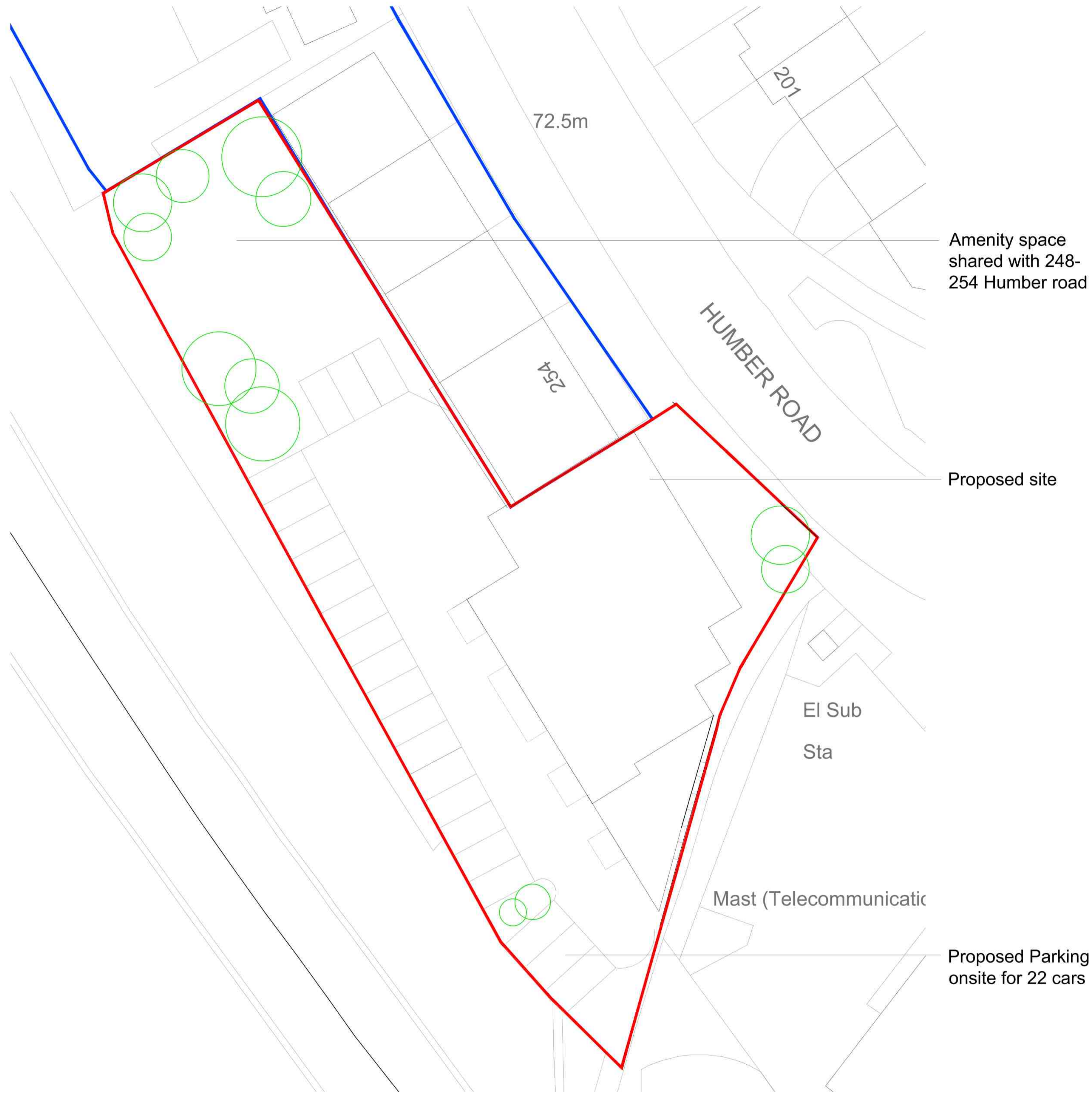
Proposed Site Plan Scale 1:200 @ A1

DRAWING CAN BE SCALED FOR PLANNING PURPOSES ONLY BUT IF IN ANY DOUBT ABOUT A DIMENSION OR ANY OF THE DRAWN INFORMATION PLEASE ASK CDRB ARCHITECTS LTD.