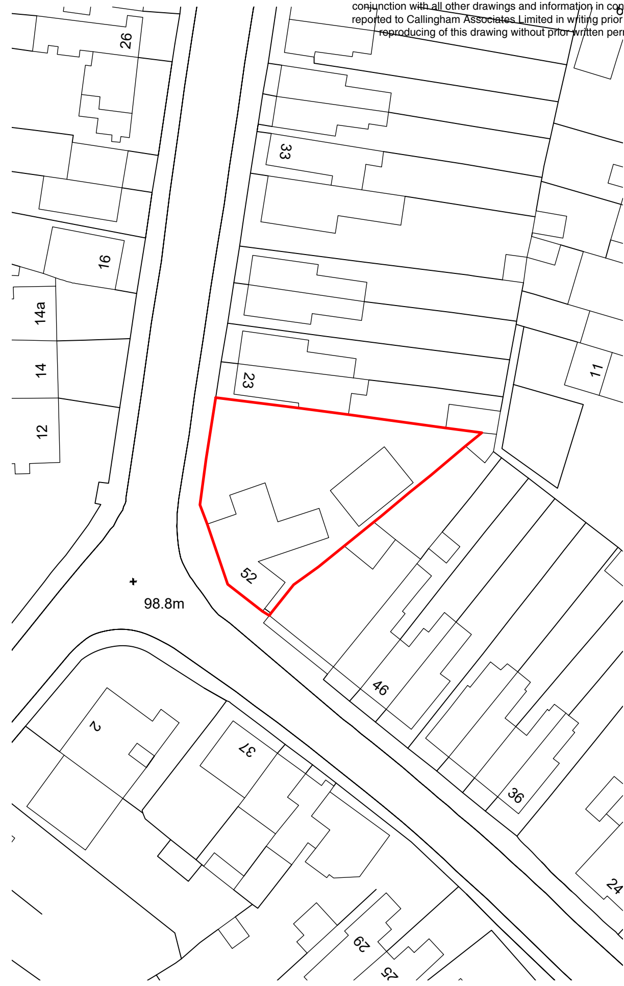
SITE PLAN 1:500 0m 10m 20m