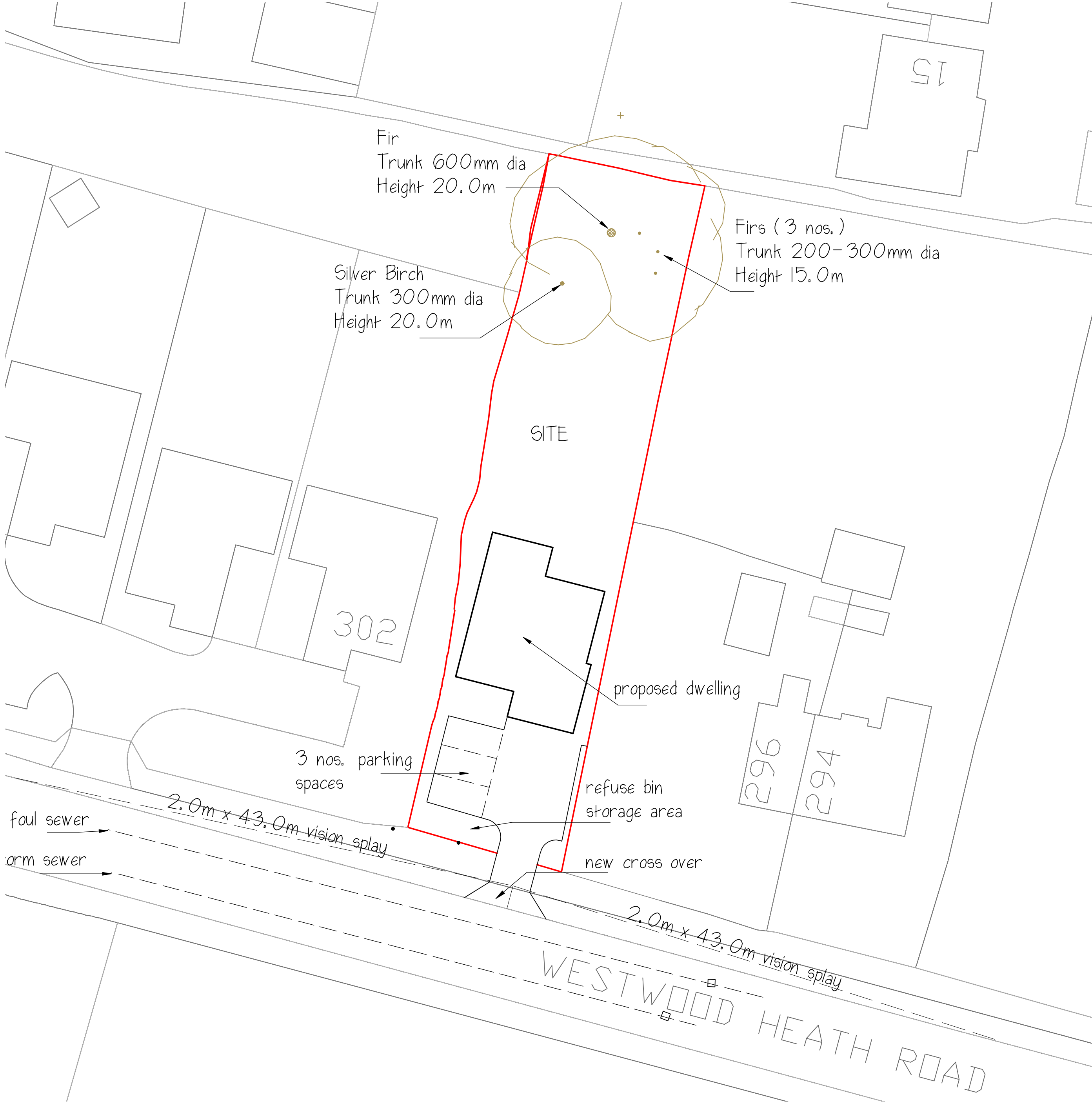
PROPOSED SITE PLAN 1:250