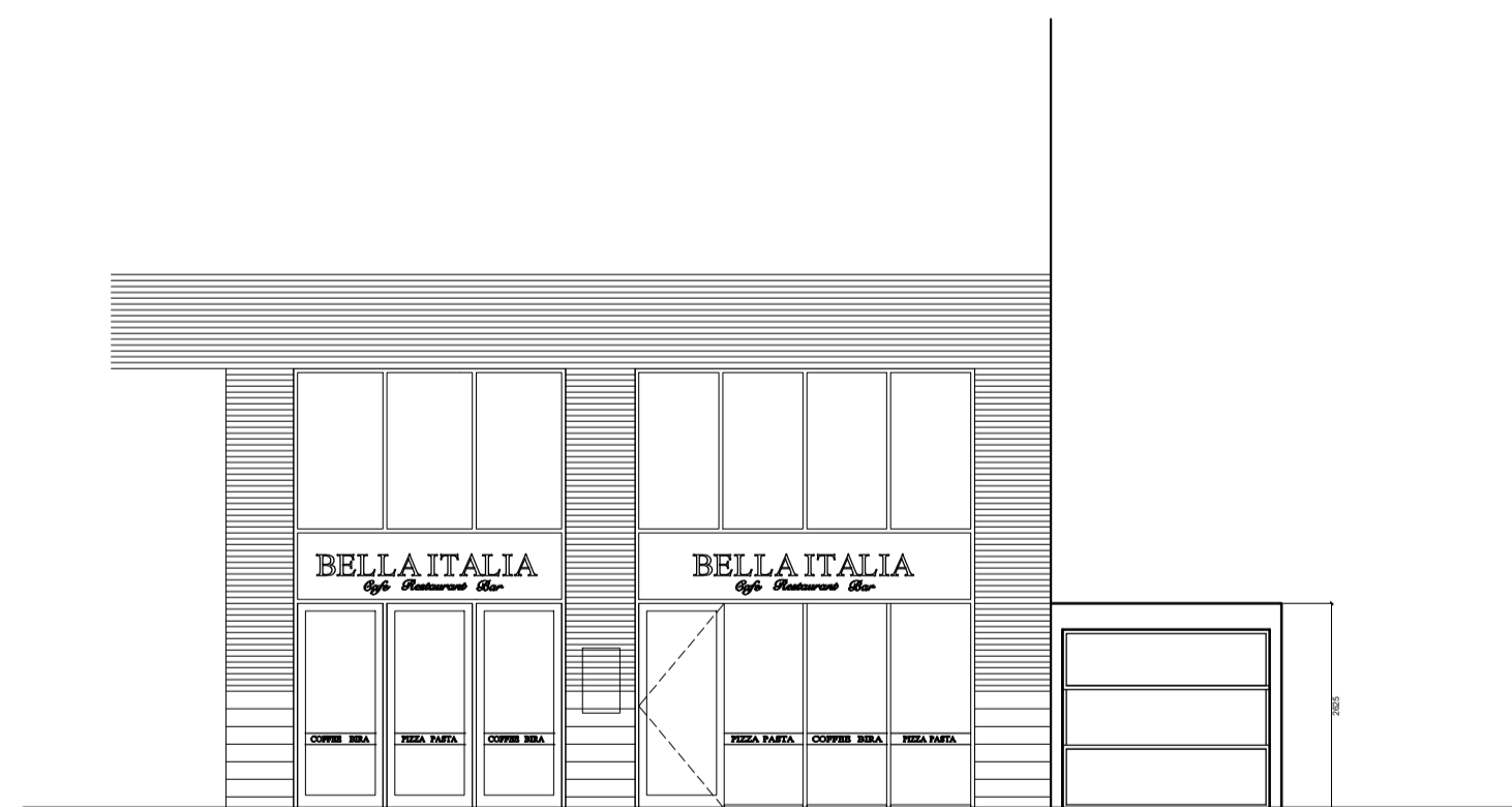
SOUTH WEST (SIDE) ELEVATION