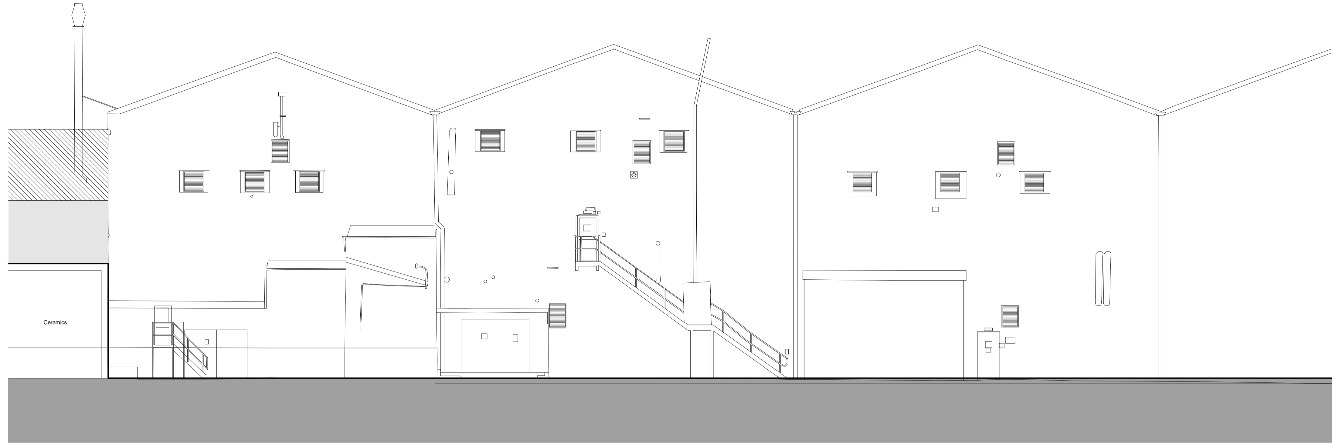
1 Elevation 1 as Existing 1 : 100