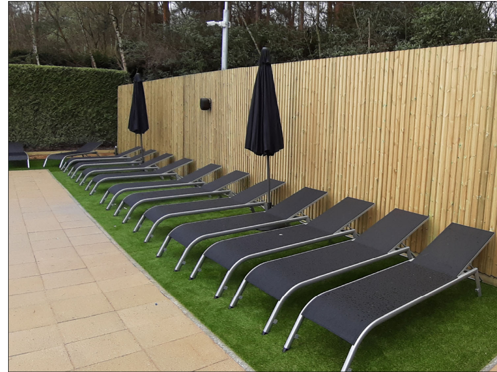
EXAMPLE OF 2.4m CLOSE-BOARDED TIMBER FENCE