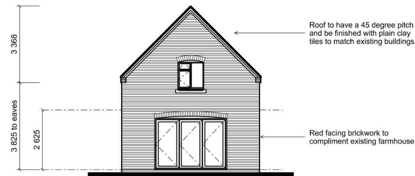
Barn 1 End Elevation (West)