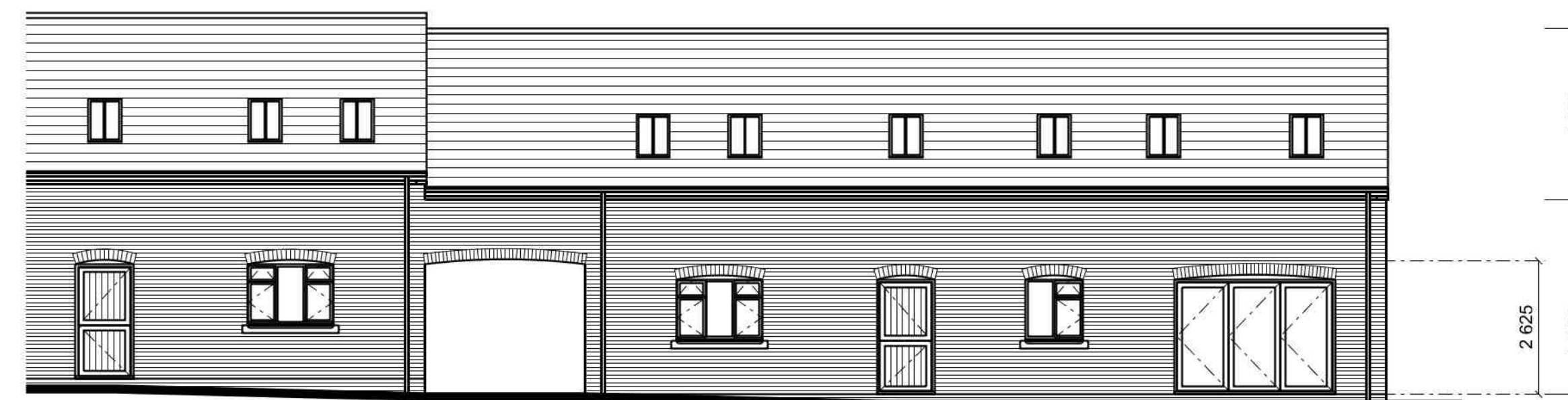
Barn 1 Rear Elevation (North)

DO NOT SCALE FROM THIS DRAWING. ALL DIMENSIONS TO BE CHECKED AND VERIFIED ON SITE. COPYRIGHT OF THIS DRAWING IS RESERVED BY DAVID FAWKNER ARCHITECTURAL DESIGN LIMITED.