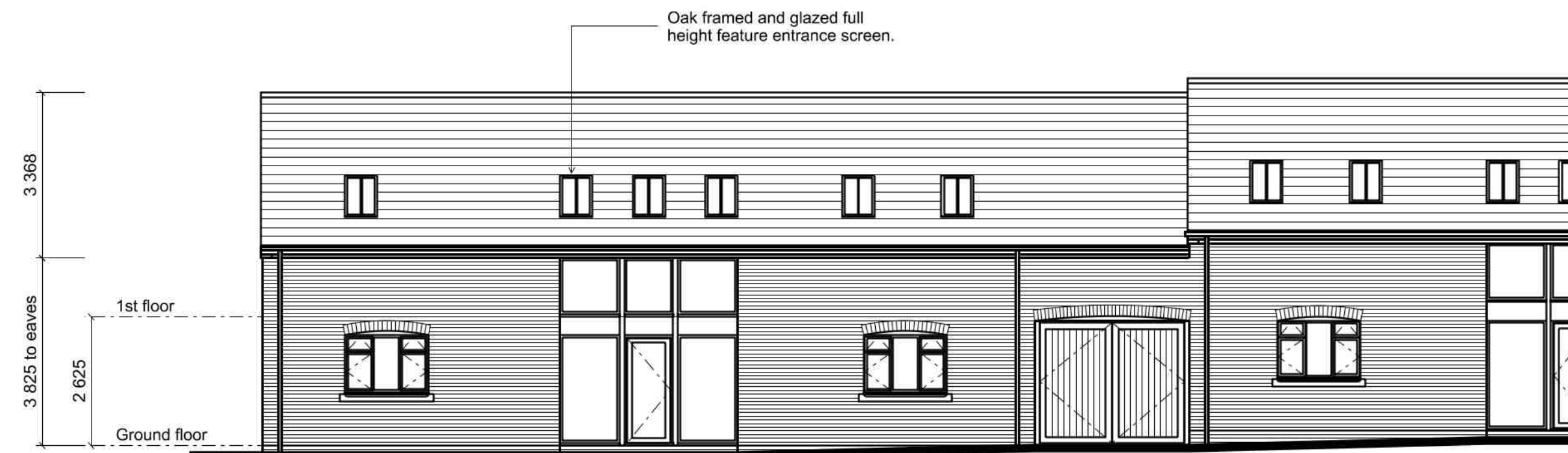
Barn 1 Front Elevation (South)