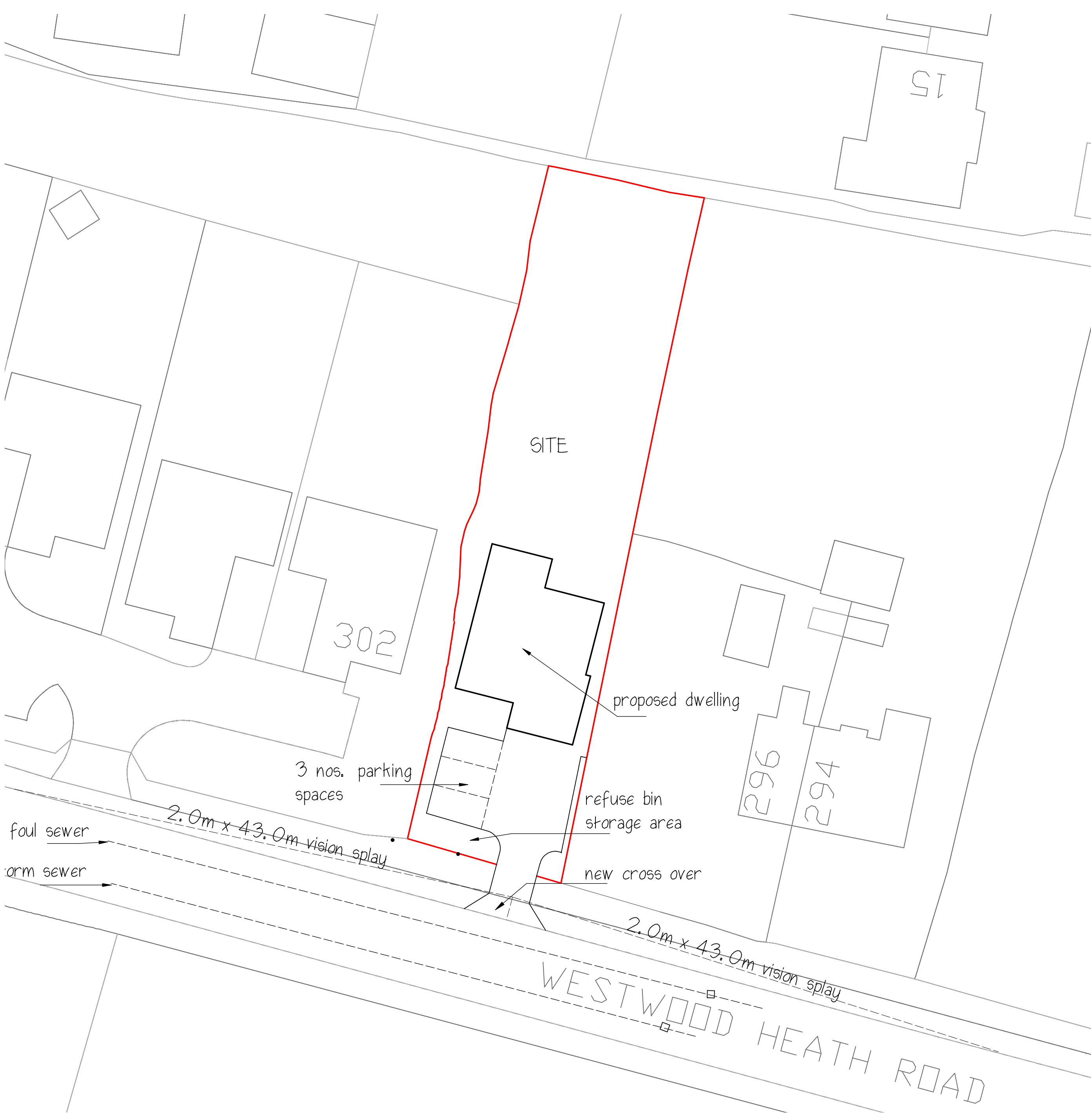
PROPOSED SITE PLAN 1:250