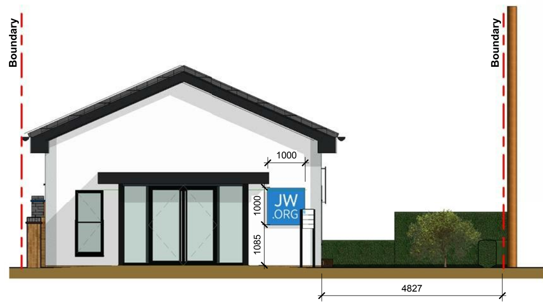
1 FRONT ELEVATION VIEW 1 : 100