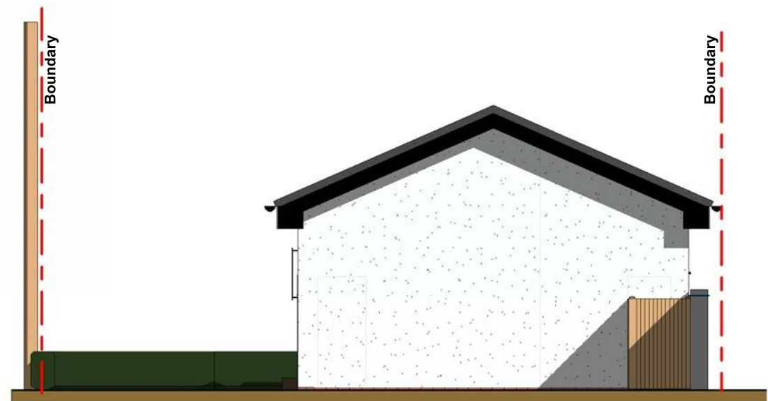
2 REAR ELEVATION VIEW 1 : 100