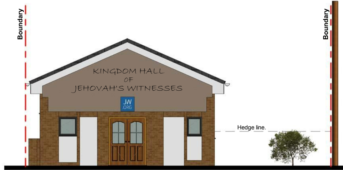
1 EXISTING FRONT ELEVATION 1 : 100