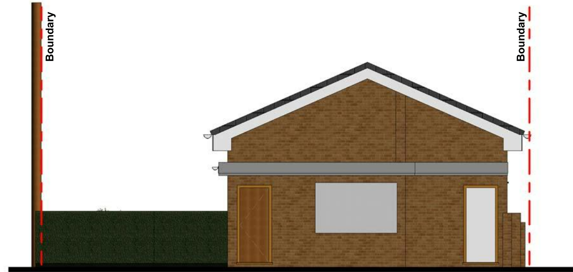
2 EXISTING REAR VIEW 1 : 100