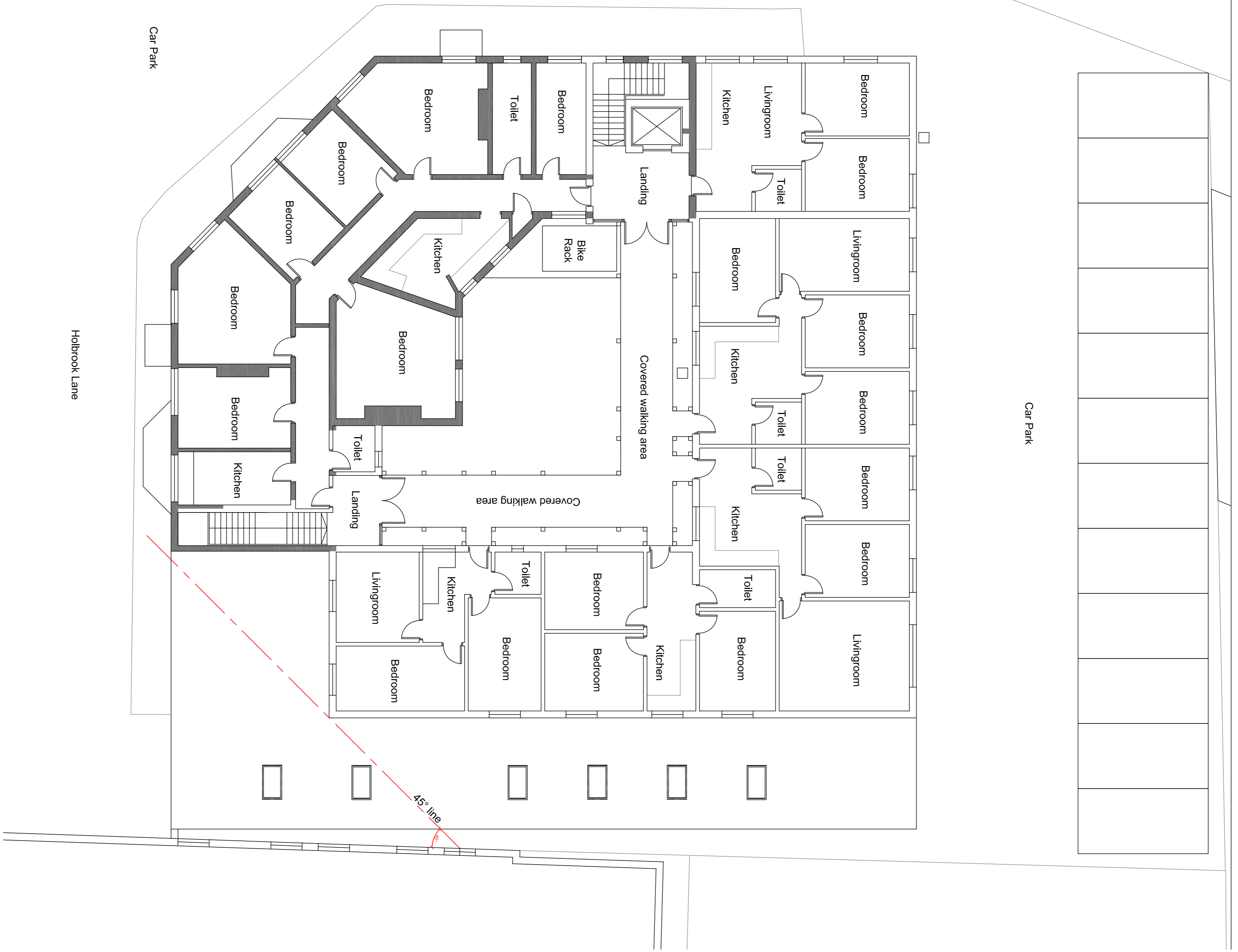
Proposed First Floor Plan Scale 1:100 @A1

GENERAL NOTES DRAWING CAN BE SCALED FOR AS PLANNING PURPOSES ONLY BUT IF IN ANY DOUBT ABOUT A DIMENSION OR ANY OF THE DRAWN INFORMATION PLEASE ASK CDRB ARCHITECTS LTD.