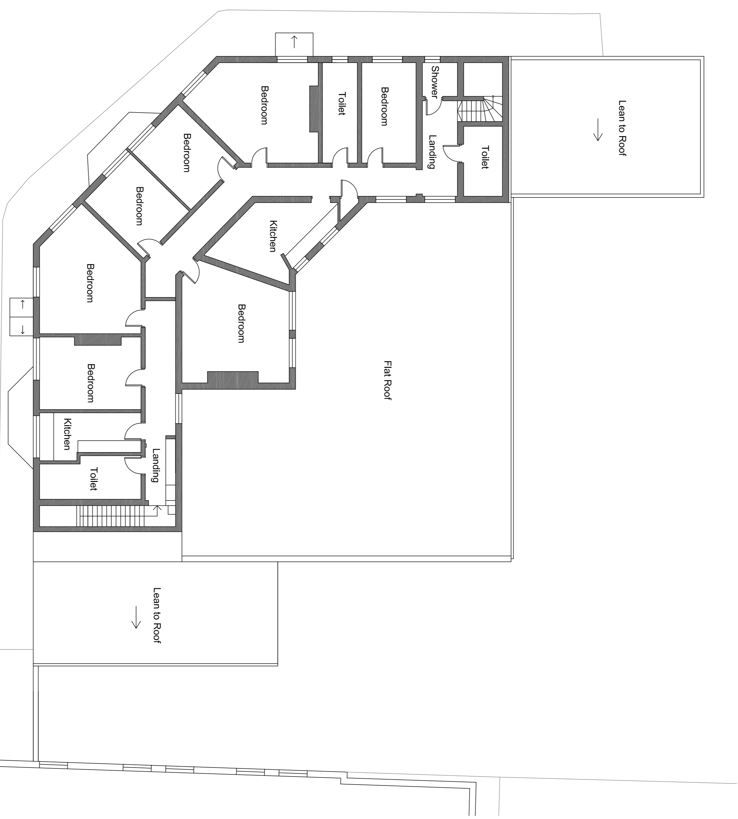
Existing First Floor Plan Scale 1:100 @A1

GENERAL NOTES DRAWING CAN BE SCALED FOR AS PLANNING PURPOSES ONLY BUT IF IN ANY DOUBT ABOUT A DIMENSION OR ANY OF THE DRAWN INFORMATION PLEASE ASK CDRB ARCHITECTS LTD.