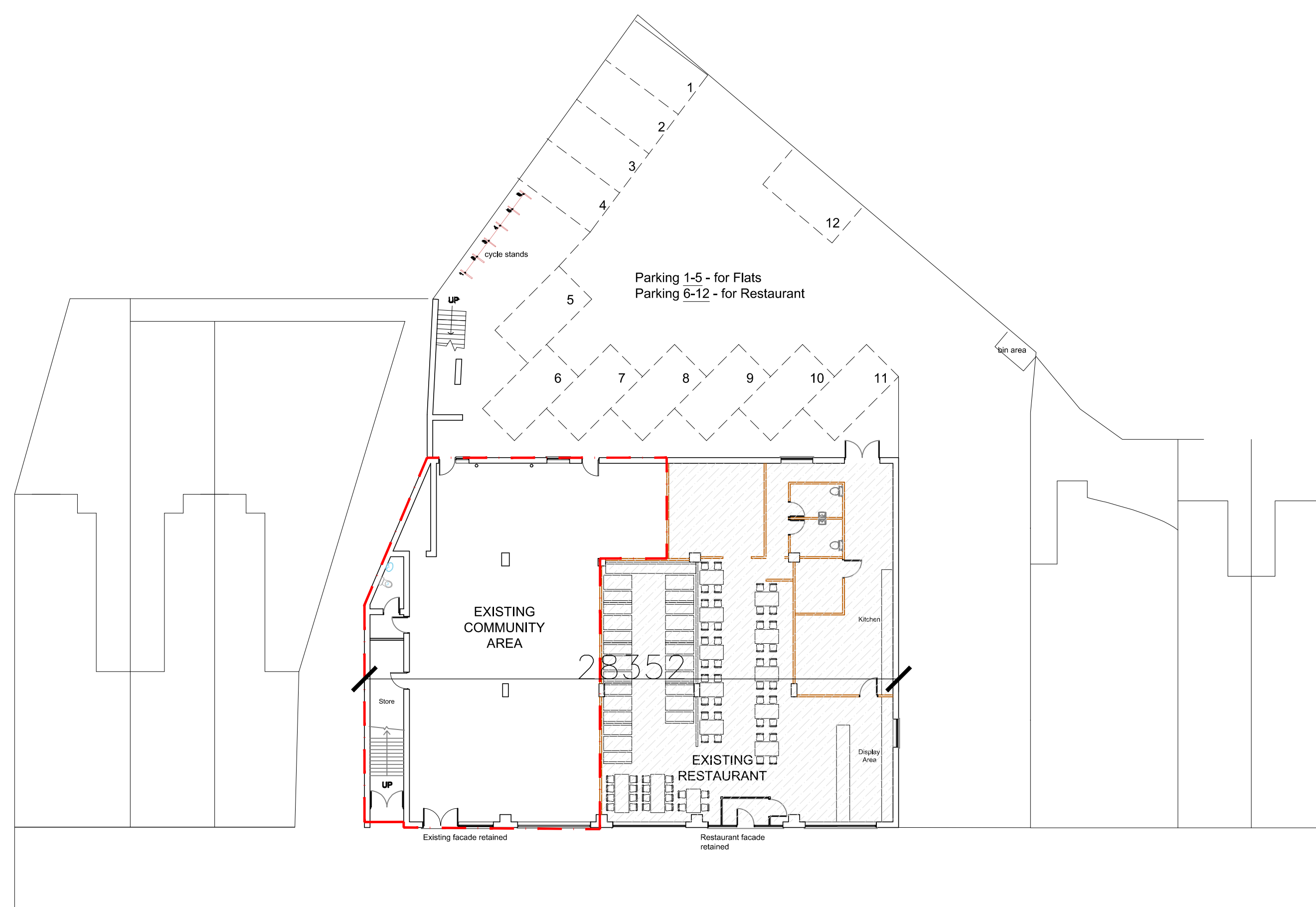
EXISTING SITE LAYOUT