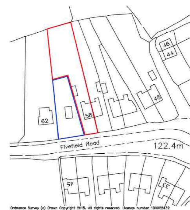
Location Plan - 1:1250