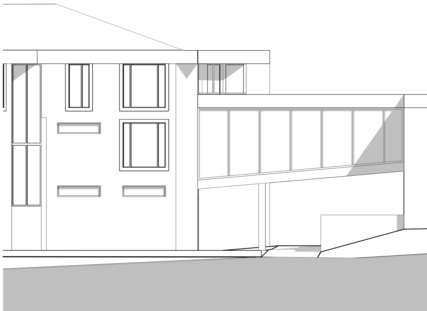
A-A Elevation Library Road (Existing) 1:100

This is the design intent, contractor to provide detail proposals for approval by design team