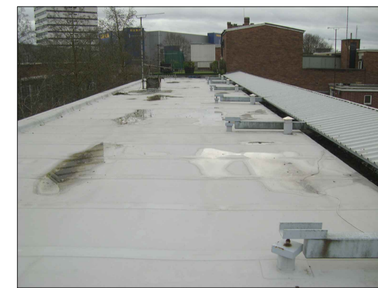
6 Roof Terrace