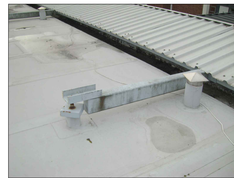
4 Canopy support detail