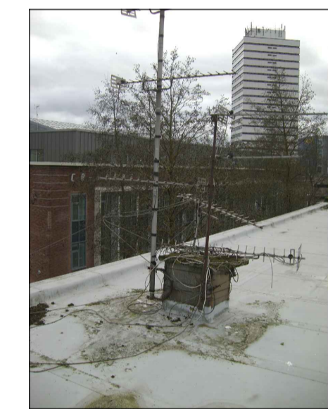
7 Antenna pod