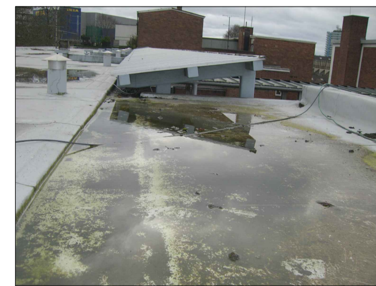
5 Canopy Side Elevation