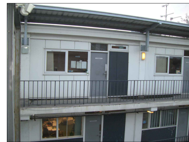
3 Canopy elevation