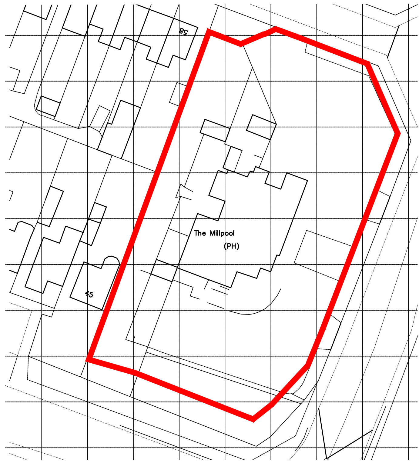
BLOCK PLAN 1:500@A3