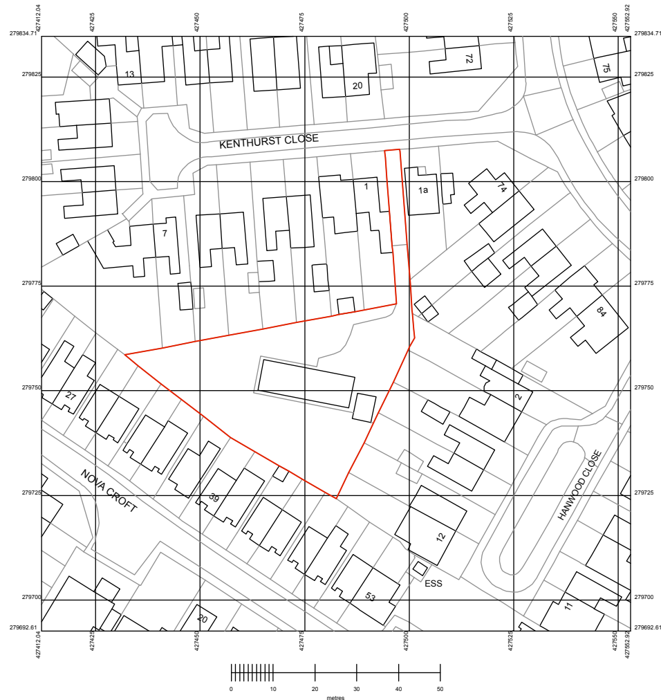
01 LOCATION PLAN 1:1250