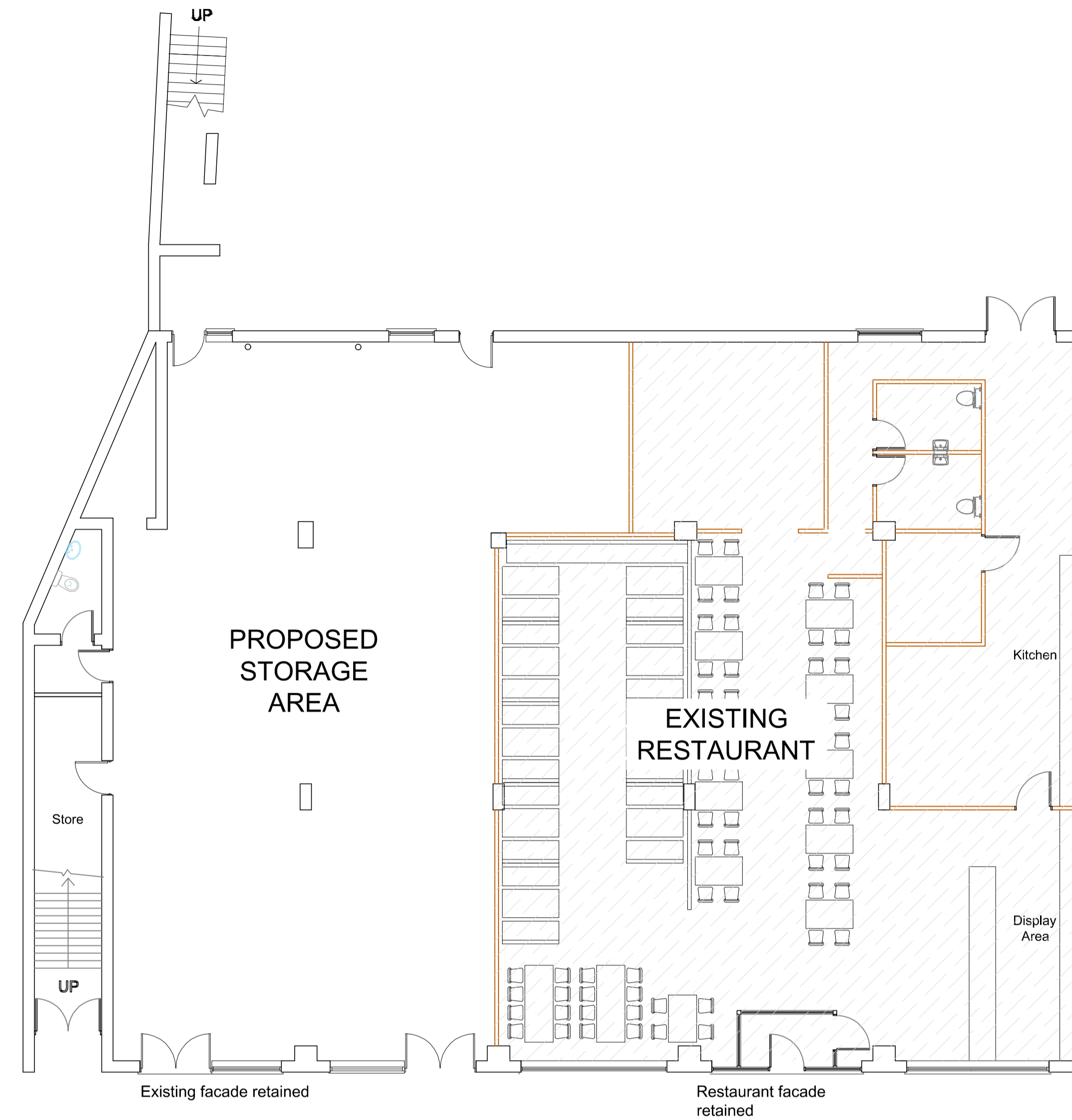
PROPOSED FLOOR PLAN