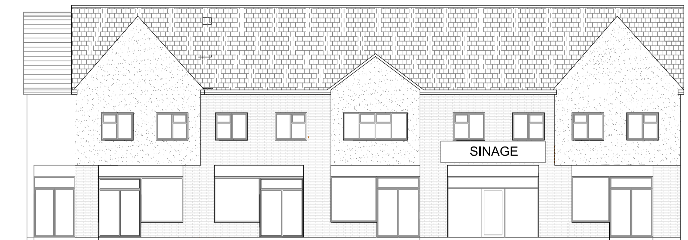
FRONT ELEVATION retained as existing